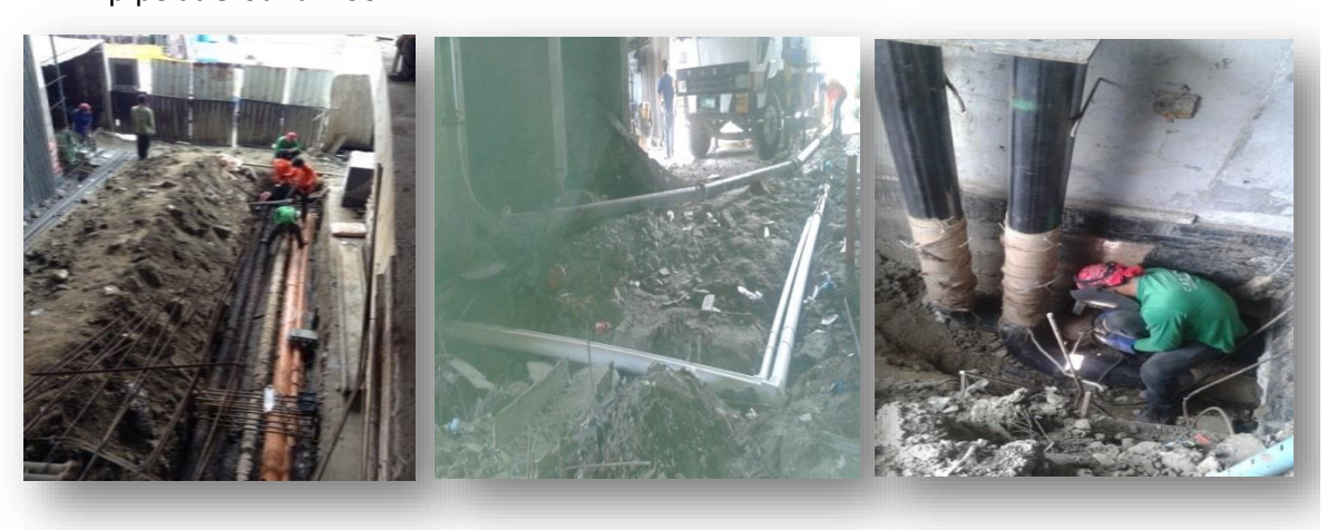
b Parking Drain Line

a Pipe laying for Storm drain, Water line and Sanitary line, Air-con drain, Fire Protection pipe at Ground Floor.