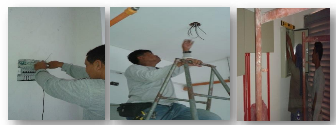
4th floor to 15th Floor - Circuit Breaker & Wire Installation at Rooms