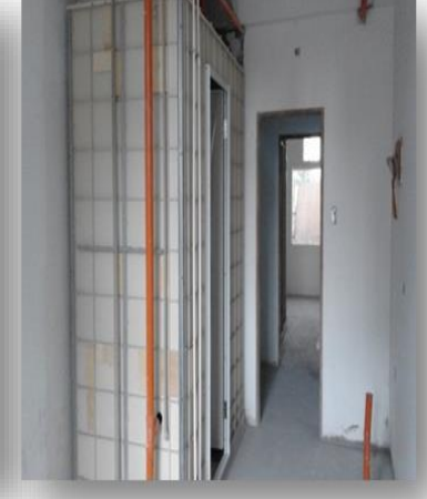
g Fire Protection, ITC and Auxiliary Drain Line