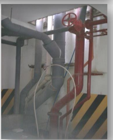
h Hydro Test/Leak Testing