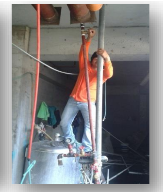
4. Fire Protection Line