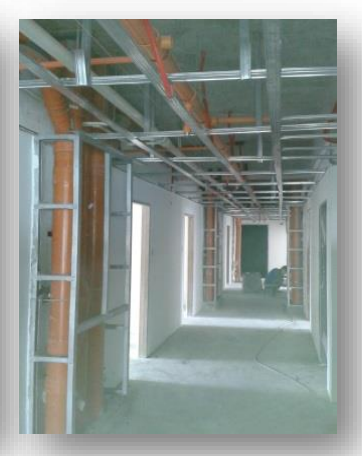
d Storm Drain Line And Water Line