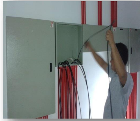
4F to 15F Meter Center & Wiring Installation at Electrical Room