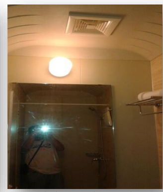
Modular Toilet Lighting