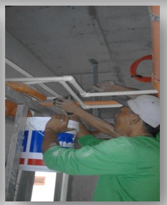
2. Sanitary Line