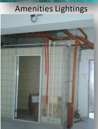
9F Room Electrical Installation